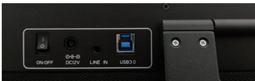
Camera Back view