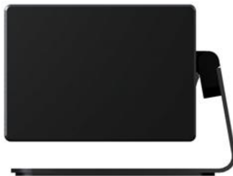
CR400 Camera Side view